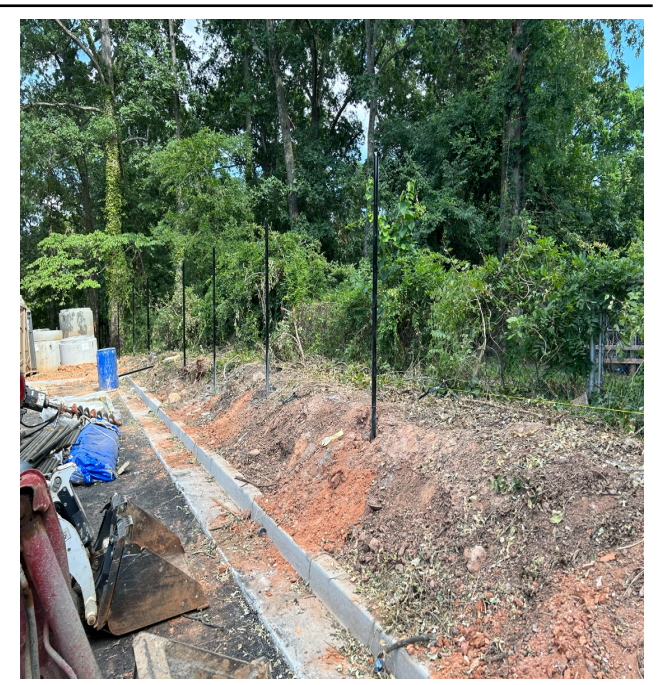
Begin installing new site fence