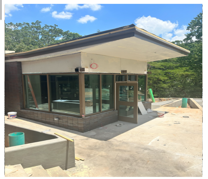
Entry vestibule storefront installed