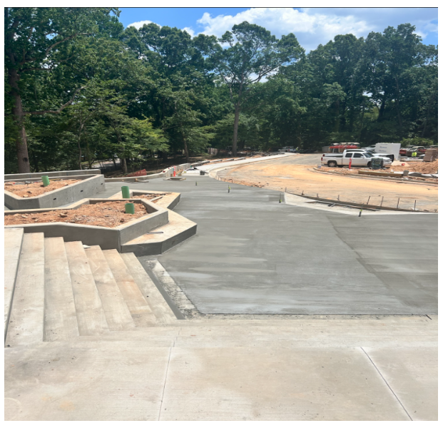
All concrete paving 98% complete